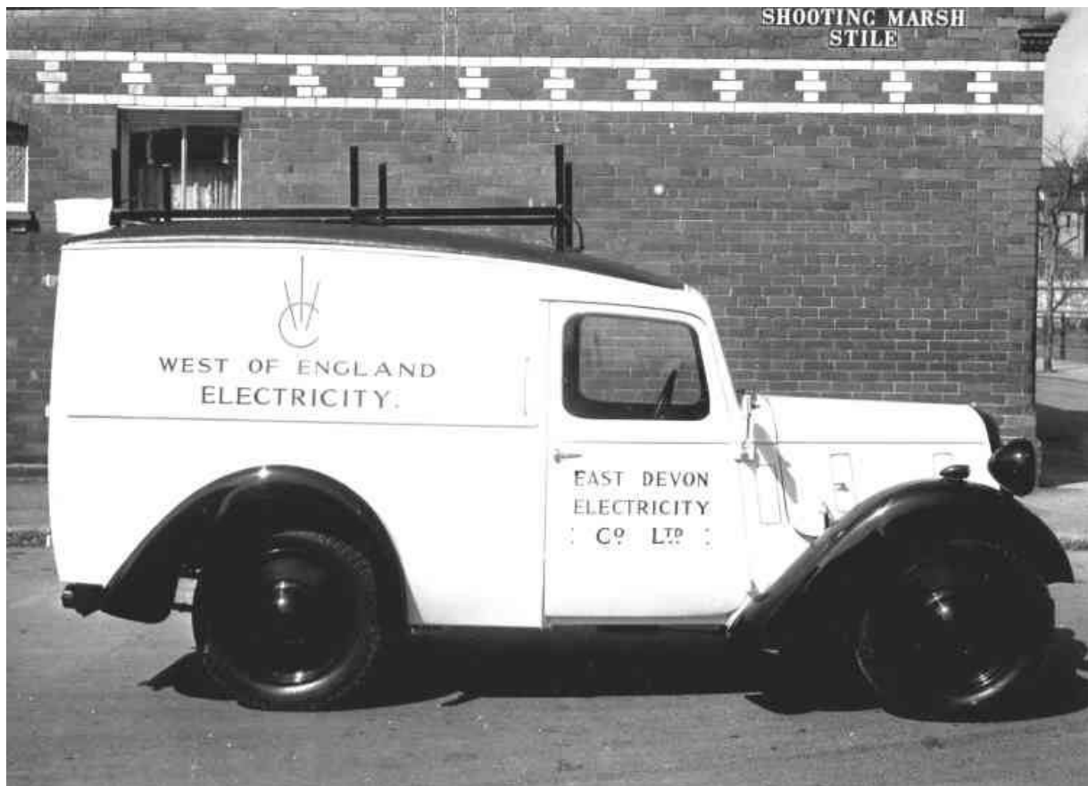
Fig. 4 East Devon van showing common monogram