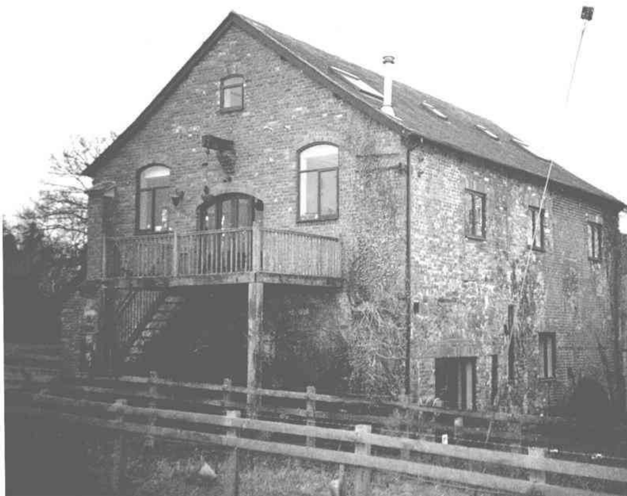
Fig.1 Culm Valley Generating Station at Bradninch

With the conclusion also of purchases of several small non-statutory undertakings and an option agreement on the Colyton undertaking on the extreme edge of the territory, the way was thus cleared for obtaining the Parliamentary powers for carrying out Dr. Purves' original scheme in a modified form.