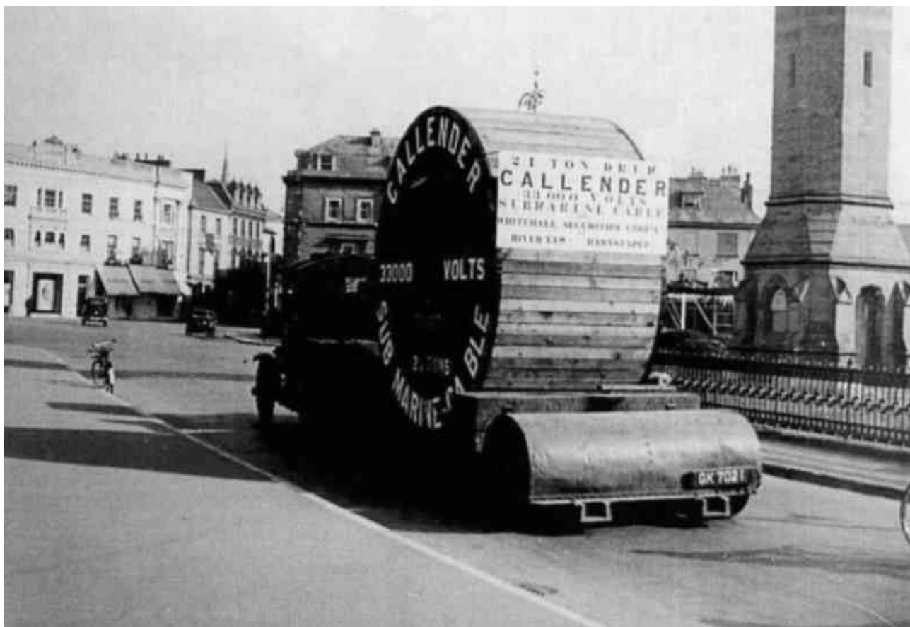
Fig.5 33kV Cable Drum being delivered for the River Tax crossing in 1934

Please note that this is an edited version and anyone wanting a full transcript should contact the Secretary.