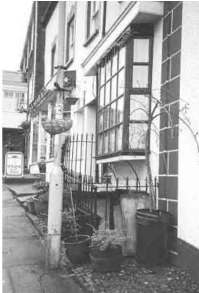
Fig.3 Showroom at Wiveliscombe

Another field of activity was in hired wiring. In the days of the agricultural depression neither landlords nor tenants could in very many cases afford the cost of installation, and the facilities, which the companies offered in this way extended their business more than would otherwise have been possible. Two schemes were available, one for providing up to six points for an inclusive weekly rental and restricting the load to 80 watts for lighting by the use of a current limiter, and the other a quarterly unrestricted arrangement on the twopart tariff. In the course of time, there was more money about, a large number of consumers changed over from the first scheme to the second. The facility to make this change encouraged the consumer to expand his use of electricity, and the schemes were on that account strongly favoured in preference to slot meters.